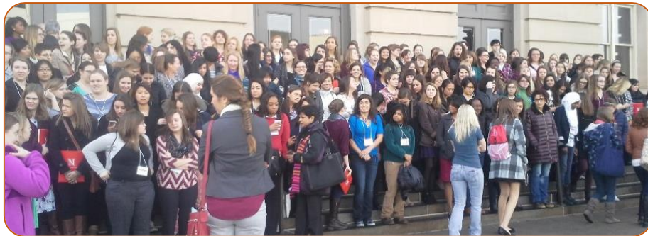
Group photo of participants of the “2015 Nebraska Conference for Undergraduate Women in Mathematics.”